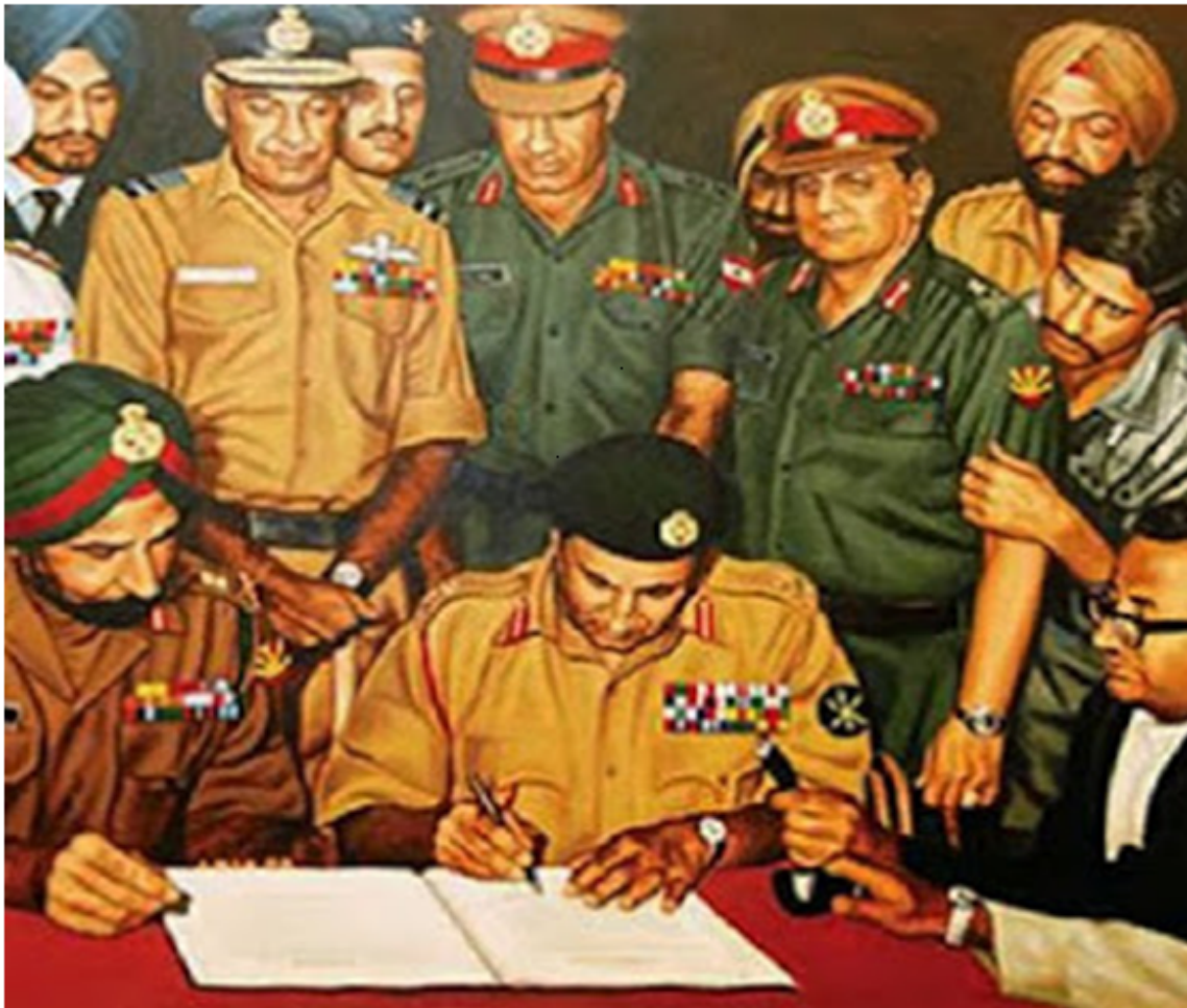
The Signing of a peace treaty by high ranking military officers.