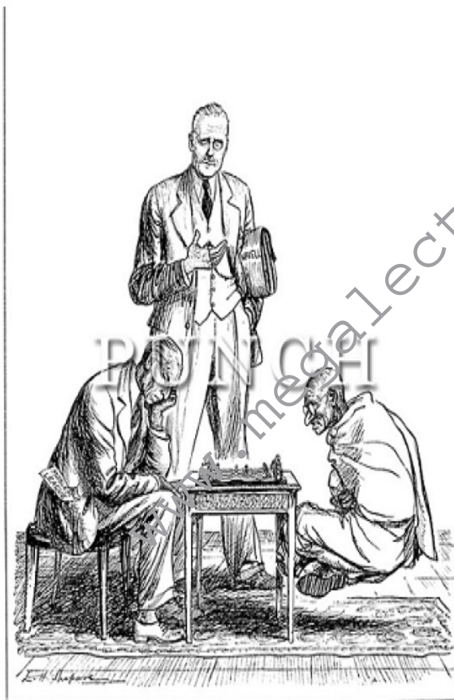
TIME FOR A MOVE

(b) Source B From Punch magazine 1945 http://punch.photoshelter.com/gallery-image/Imperialism-and-Colonialism-Cartoons/G0000vKN2v8ZjQ.g/I0000dfowl2gJnmM